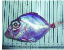
Red Dory ( Cyttopsis roseus )