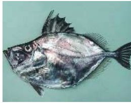
Sailfin Dory ( Zenopsis conchifer )