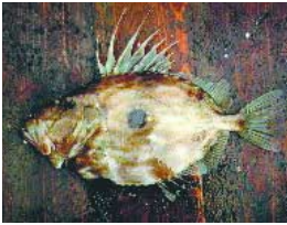
John Dory ( Zeus faber )

(Pisces: Zeidae) in Irish & NW European Seas