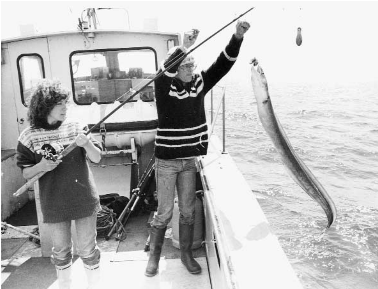
A Fine Catch: Fishing for Conger Eel off Dungarvan, Co. Waterford