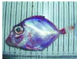
Red Dory ( Cyttopsis roseus )