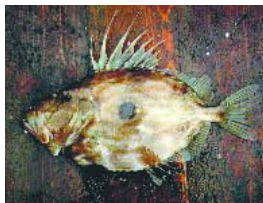
John Dory ( Zeus faber )

(Pisces: Zeidae) in Irish & NW European Seas