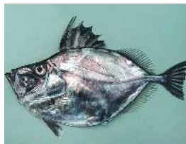
Sailfin Dory ( Zenopsis conchifer )